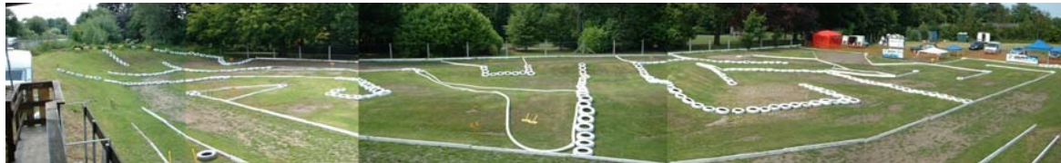
This is the track layout for 2006 national

Premier lodge Phone Number: 01282 450250 Address: Queen Victoria Road, Burnley, BB10-3 Travel lodge Phone Number: 01282 416039 Address: Barracks Road, Burnley, BB11-4 Other local hotels - name/number